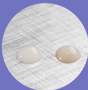
Clear formula (D-Lish Varnish pictured on left.)

Smooth, translucent no-mix formula | Sensitivity relief for all ages | Gluten-free