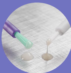
No stringing or clumping (D-Lish Varnish pictured on left.)