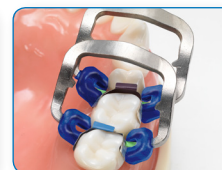
Stackable with wide visibility