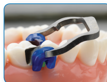
Secure fit at gingival margin

Secure Fit: Fits securely along the gingival margin for better overall adaptation