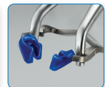
Easy to open with a strong grip

Order today through your preferred dealer.